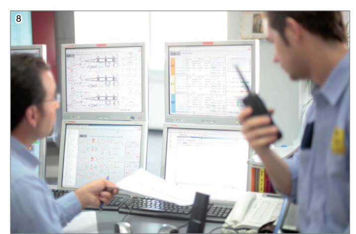
7 Remote field device management | 8 Proactive maintenance through system visibility of device performance