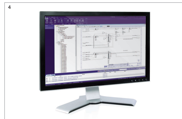
3 HR Series scalable controllers BRC300, BRC400, and BRC410 | 4 S+ Engineering tool