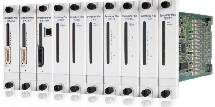
1 HR Series control and I/O

Achieving total plant automation with a single control and I/O platform. Symphony® Plus is the new generation of ABB's highly acclaimed Symphony family of distributed control systems – the world's most widely used DCS in power generation and water management applications. In all, there are more than 6,500 Symphony DCS installations in operation all over the world, more than 4,500 of which are in power and water applications.